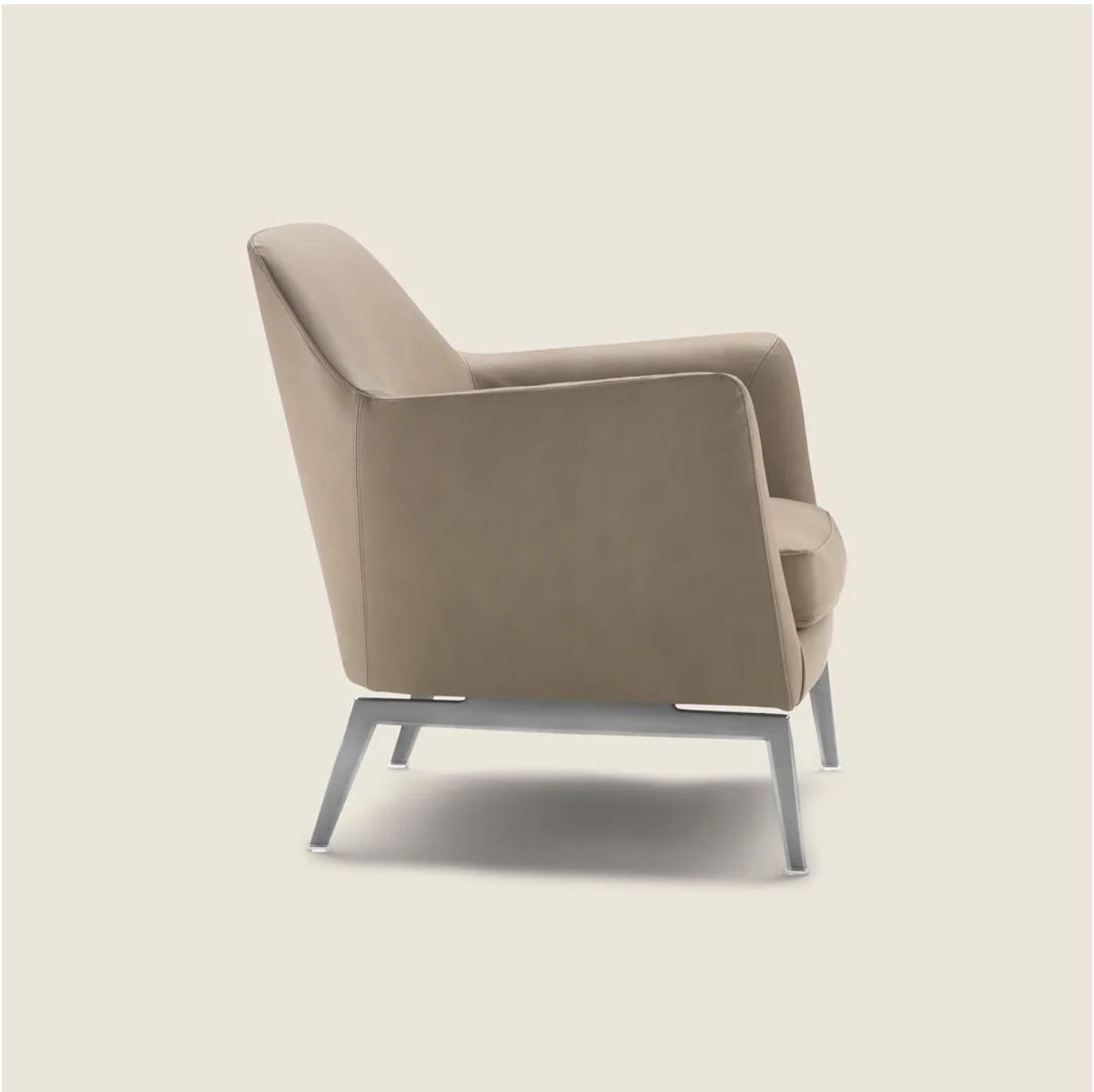
LUCE ANTONIO CITTERIO 2015 ARMCHAIRS