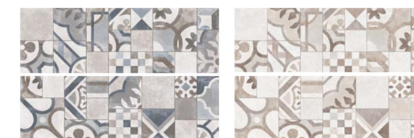
Decoro Century Grey 25x76 M7TS