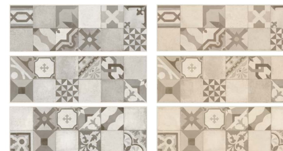
Decoro Vantage White 30x90 M13C (rif. White, Grey)