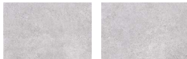
Naturale · Matt