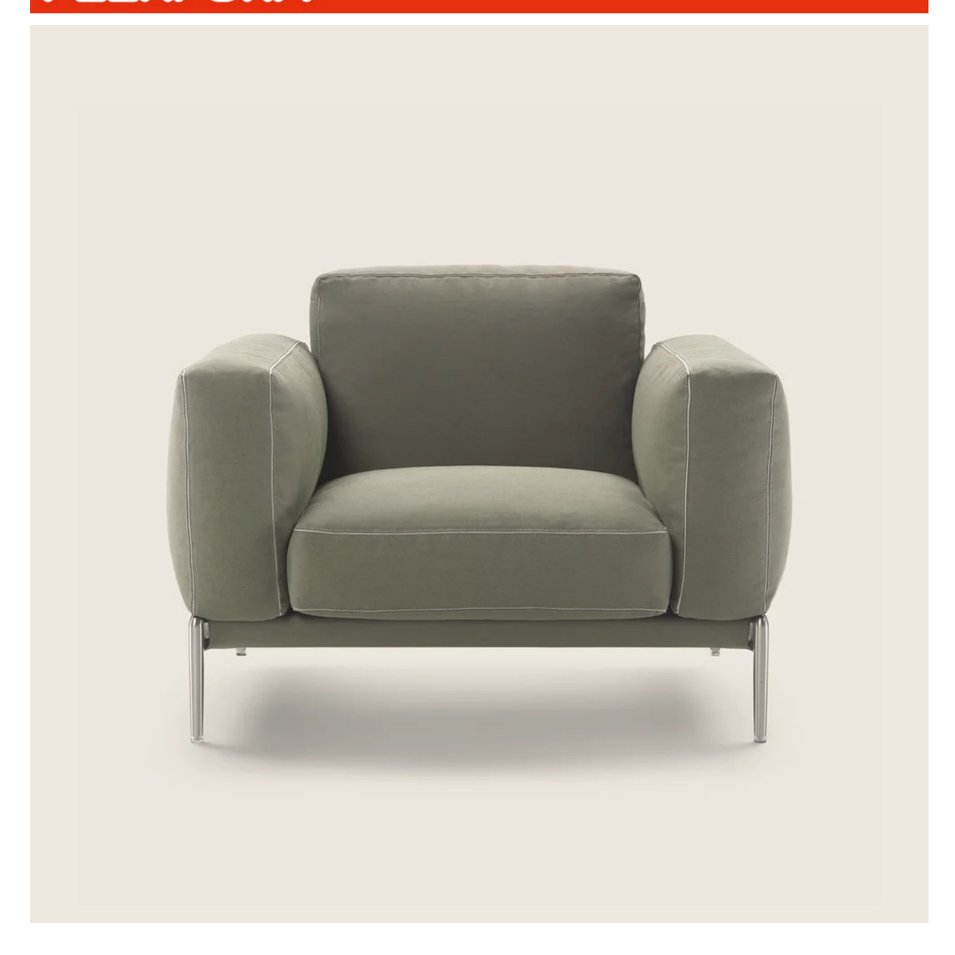
ROMEO COMPACT ANTONIO CITTERIO 2019 ARMCHAIRS